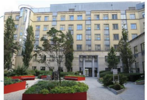
Mundo-Madou Av. des Arts 8 1210 Bruxelles