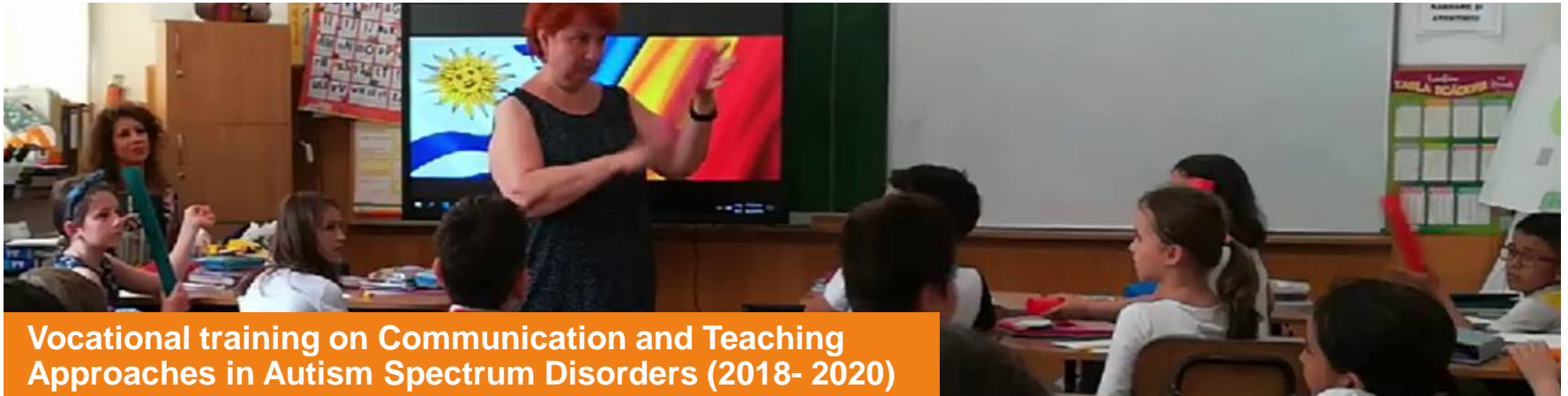
Vocational training on Communication and Teaching Approaches in Autism Spectrum Disorders (2018- 2020)