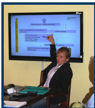
Presentation of best practice on the use of ICF

On 16 June in Helsinki, a benchmarking group on the use of ICF gathered participants from five organisations. This activity focused on the application of ICF and aimed at reviewing work in progress in each of the participating centres and reflecting on how best to move forwards with implementation.