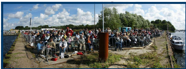
Heliomare clients taking in the breathtaking nautical parade Sail 2010.