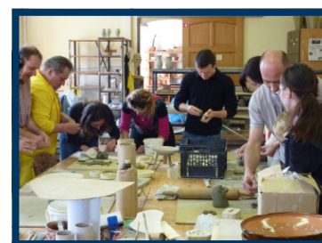
Visit of the pottery workshop in Ozara d.o.o., Slovenia

Contribution from Zdenka Wltavsky, URI, zdenka.wltavsky@ir-rs.si