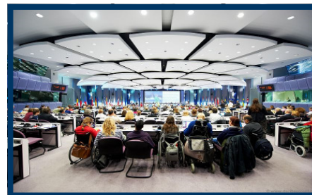
The annual policy conference to mark the European Day of People with Disabilities took place in Brussels in December.

The conference also incorporated the Access City Award ceremony during which the Spanish City of Avila, known for its medieval walls and many churches, was rewarded for its commitment to become more disabled-friendly. All documents related to this Conference can be downloaded from the European Commission website: http://ec.europa.eu/social/main.jsp?catId=88&langId=en&eventId=283&furtherEvents=yes