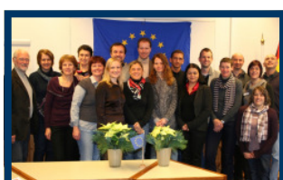
Project partners at the kick-off meeting in Oslberg