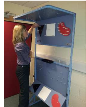
Work trial of physical capabilities in job context