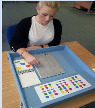
Work trial „independent troubleshooting” – attention, concentration, cognitive skills