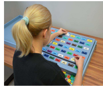
Multi-level sorting work trial (checks general skills, manual and cognitive decisive)