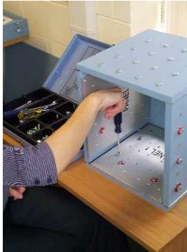
Technical tasks trial „small tools