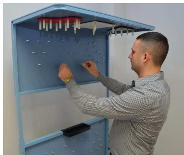
Work trial of physical capabilities in job context

During the assessment, the subject person receives employment counselling, psychological support, work career recommendations and a detailed report on her strengths and development options.