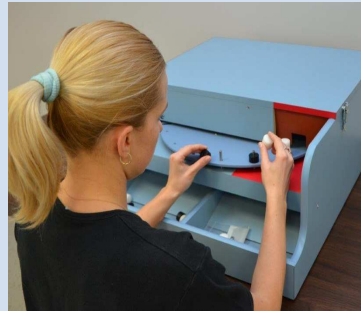
Assembly line work simulation