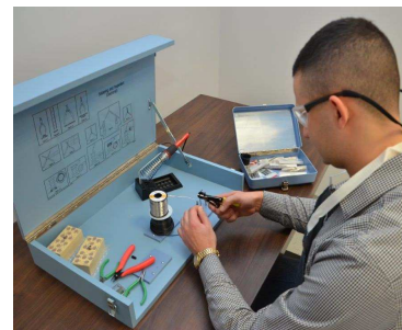
Technical work trial - soldering