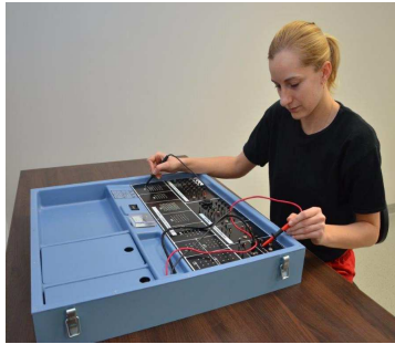
Technical work trial – electric circuits